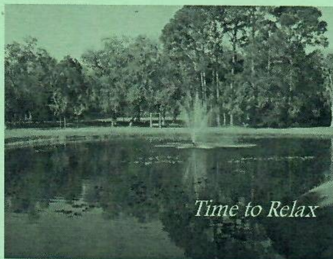
Time to Relax

(Twelve Steps & Twelve Traditions, pg. 96)