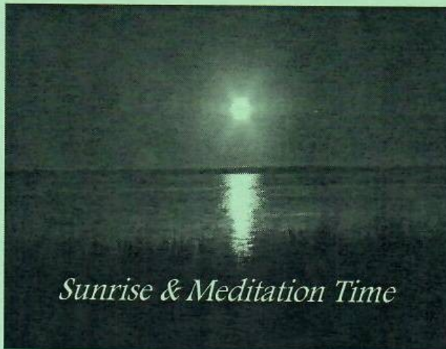
Sunrise & Meditation Time

Enjoy the Fellowship of a Spiritual Retreat for AA/Al-Anon in Peaceful, Country Surroundings.