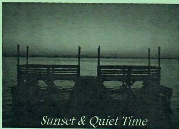
Sunset & Quiet Time

LAKE YALE IS THE PERFECT GETAWAY FOR US TO SEEK TO IMPROVE OUR CONSCIOUS CONTACT WITH GOD.