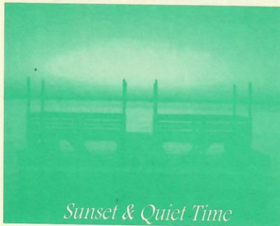
Sunset & Quiet Time

LAKE YALE IS THE PERFECT GETAWAY FOR US TO SEEK TO IMPROVE OUR CONSCIOUS CONTACT WITH GOD.