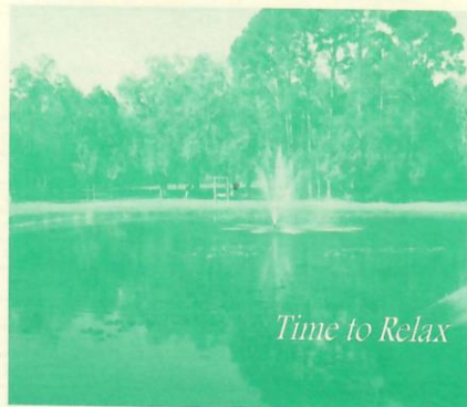
Time to Relax

(Twelve Steps & Twelve Traditions, pg. 96)